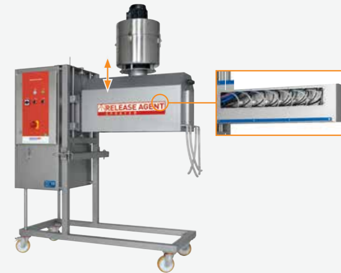
Movable RELEASE AGENT SPRAYER on C-frame

The movable stainless steel frame is the base of the machine on which the units (spray hood, exhaust) are mounted. The main cabinet holds the pneumatics and the liquid holding tank.